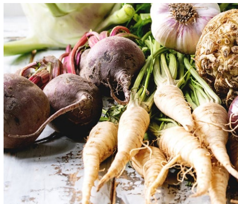
Plant beets, carrots and more

This is the ideal time to plant bare root roses, fruit trees, and ornamentals. Leek starts are due mid-month as are short day onion starts. Plant these vegetables now: Artichoke, Asparagus, Beets (seed), Broccoli, Cabbage, Carrots (seed), Celery, Endive, Kale, Kohlrabi (seed), Lettuce, Onions, Parsley, Parsnips, Peas, Radish (seed), Spinach, Swiss Chard, and Turnips (seed). Look for these: Camellias, Azaleas, Holly, Pyracantha, roses and fruit trees. Don't miss Pansies, Violas, Stocks and Snapdragons.