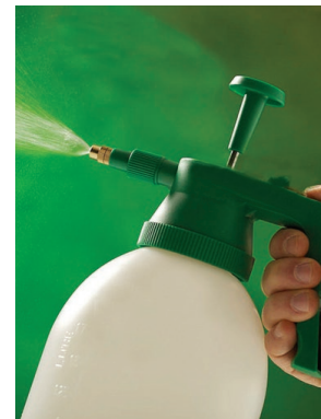
Spray for diseases & pests