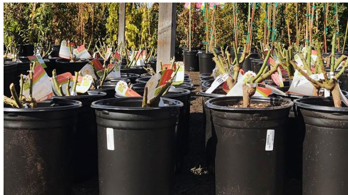
It's time to plant bare root roses