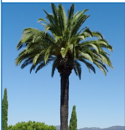
A healthy Canary Island date palm

trees and lay their eggs near the base of young fronds. The larvae hatch and bore into the crown and trunk killing fronds and eventually the entire tree. Symptoms of an infestation are yellowing foliage, flattening of the crown, holes, tunnels, accumulation of frass at the base of fronds, and pupal cases on the ground near the base of the trees. According the University of California Cooperative Extension, keeping trees healthy, reducing pruning, and using a systemic insecticide may provide the best control. Research is still ongoing. Evidence of this damage can be seen all around San Diego with many examples in Presidio Park and the San Diego River bed. •