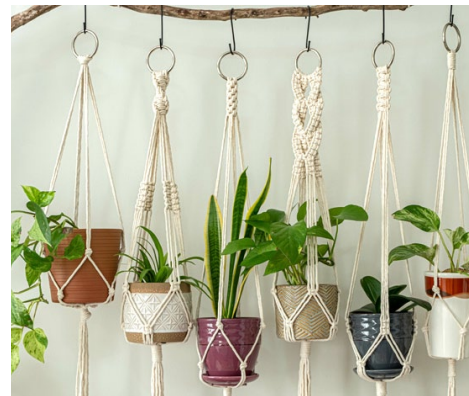
Macrame hangers are gaining popularity