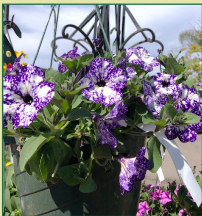
Petunia 'Night Sky'

succulents looked terrific and the sedum was ablaze in yellow flowers. Don't miss this new variety of Petunia, called Night Sky. It is sprinkled with white dots against a deep purple background that does indeed resemble a night sky. •