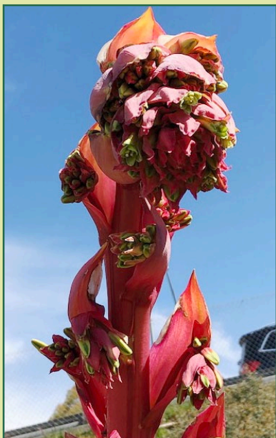
Beschornelia yuccinoides 'Flamingo'

Before spring sprung, we were treated to some spectacular blooms at our Poway store. What caught our eye? If you ventured out to the succulents you would have seen the Beaucarnea recurvata and Beschornelia yuccinoides 'Flamingo' in full bloom. After the rain we had, the