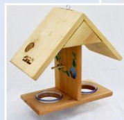
Double Jelly Feeder