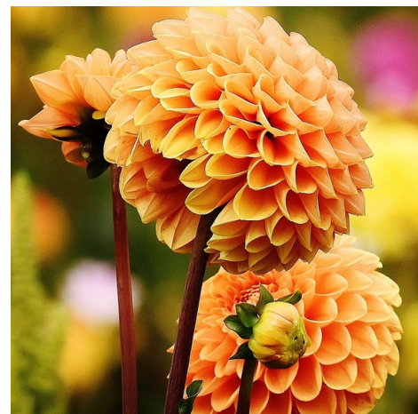
Plant Dahlias, annuals and perennials