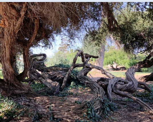
Australian Tea Tree in Balboa Park

color provide the canopy while the trunk is the real show stopper. As they get older, the trunks will twist and turn and develop deep furrowed, brown bark. Sometimes the trees will lean or lie down and grow sideways which adds to their uniqueness.