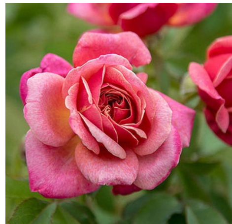
Queen of Elegance

This apricot blend has excellent disease resistance. Blooms are bronzy pink at the outer petal, melting into a golden center. •