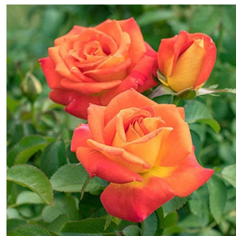
Burst of Joy

An orange rose accented with a sunny yellow reverse. This rose loves hot, dry climates.