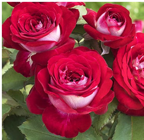
Love At First Sight