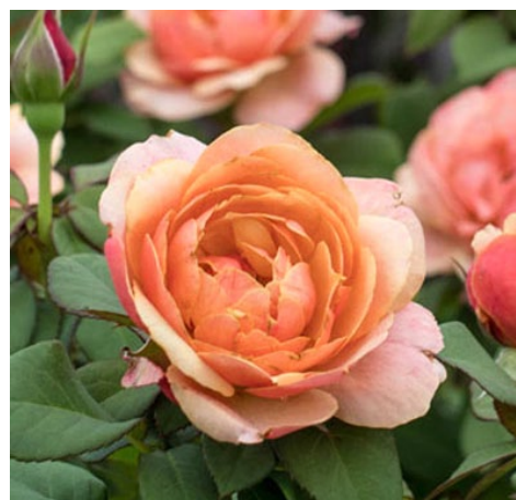
State of Grace