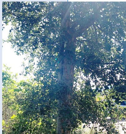
Cork Oak Tree