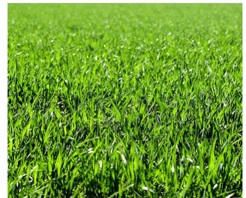
Prevent crabgrass in your lawn

Dormant Spray for diseases and overwintering insects. Use oil spray to control overwintering insects and insect eggs. Use Liqui-Cop to control fungus on fruit trees and roses, Peach Leaf Curl and more on peaches and nectarines.