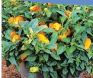
'Mohawk' Bell Peppers

The past year has shown a huge trend toward growing edibles in the garden. In addition, people are gravitating toward plants that take up less space without sacrificing the quantity and quality of production. This spring, in addition to the old favorites, we're going to be bringing in some new, great space-saving varieties from Burpee Seeds.