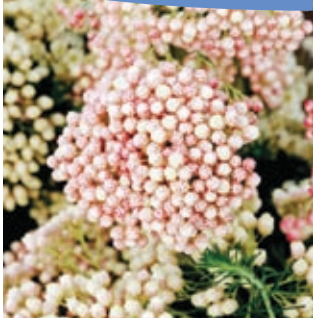
Ozothamnus 'Rice Flower'

As the weather truly warms to herald the arrival of summer, you will notice the arrival of one of my all-time favorite flowers: Lisianthus. It is sometimes known as "Blue Lisa's" (though they come in many more colors) and "Texas Bluebell". Lisianthus herald in the season of cut-flowers. So many bouquet-worthy plants