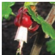
Fuchsia flowered gooseberry