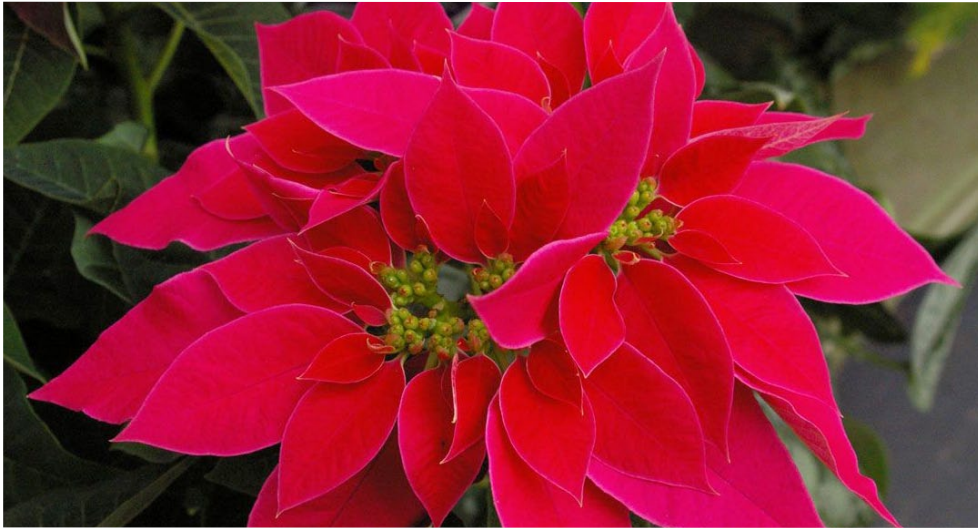
'Luv U Pink'

well outside too. We will have a limited supply of these in both stores. Look for the red, white and pink blooms in each pot! Other poinsettia choices include traditional pink, red, burgundy, and white poinsettias, along with Marble and some of the autumnal colored ones, 'Gold Rush' and 'Orange Spice'.