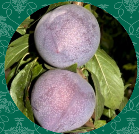
Pluerry 'Candy Heart'

In the next few months you will see a change in Old Ben's seed bags and labeling. You'll be able to buy the same great products but with higher quality control. •