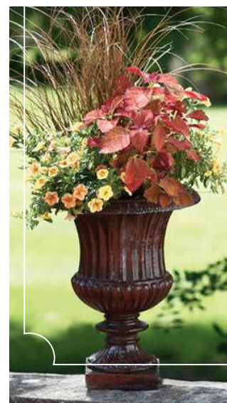
'Thrillers' and 'spiller' by Proven Winners