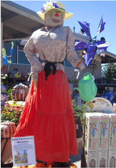
Here's one of the WAN scarecrows we made with the scarecrow kit.

in the container. How is this container design for a fall look at your front door?