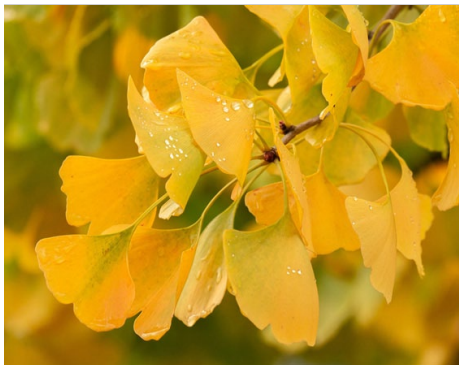
Plant Ginkgo Trees

California natives and drought-tolerant plants are best planted this time of year to get root systems established. Bulbs like Daffodils, Ranunculus, Freesias, Anemones and more. Winter annuals like Stocks, Snapdragons, Pansies, Violas, and Primrose. Cool season vegetables, shrubs such as Camellias and Azaleas, and trees that