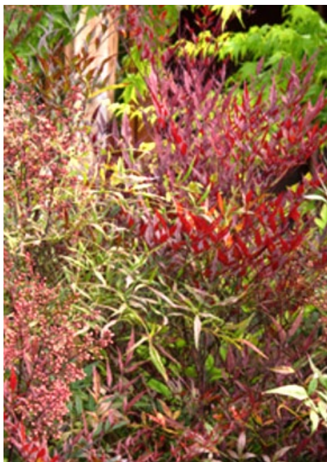
Plum Passion Heavenly Bamboo

Delightful small garden tree with handsome cinnamon-hued bark and very ornamental red and yellow strawberry-like fruit in fall and winter. Marina grows up to 30' tall and wide, other varieties are smaller. Full sun. Use: Fruits are edible and commonly used in preserves, wines and liqueurs. Birds