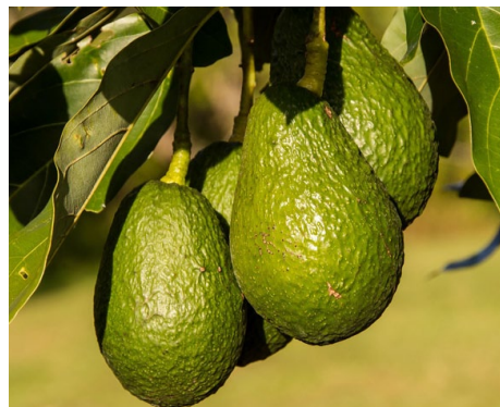
Feed Avocados with Gro-Power

For lawns, use Marathon Fertilizer for tall fescue, and Bonide DuraTurf Weed & Feed to feed grass and control broadleaf weeds. Feed ornamentals with Gro-Power. Feed vegetables with Gro-Power Tomato and Vegetable Food or Dr. Earth Organic Tomato and Vegetable Food. Feed citrus, avocado, and fruit trees with Gro-Power Citrus and Avocado Food. Feed palms and tropicals with Gro-Power Palm Tree and Tropical Food. Do not feed Camellias until after they are finished flowering. •