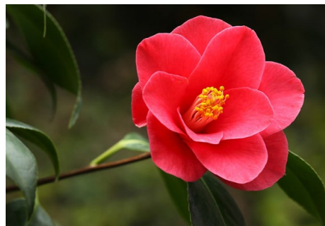
Feed Camellias after they finish flowering