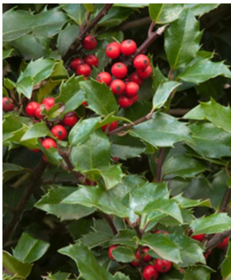
Berri-Magic Holly Combination