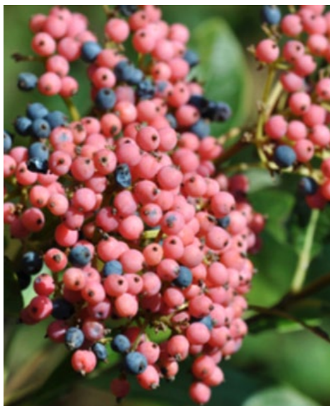
Winterthur Smooth Viburnum

Berries are assured because a male pollenizer is planted in the same container as fruiting female. Up to 8' tall, 6' wide. Partial to full sun. Use: Single specimen or dense hedge. Berries for wildlife and crafts.