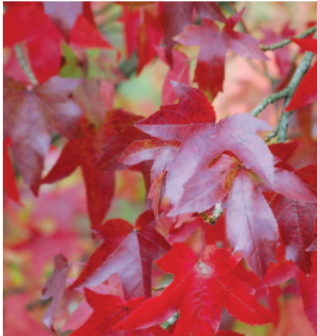
Liquidambar Trees for Fall Color