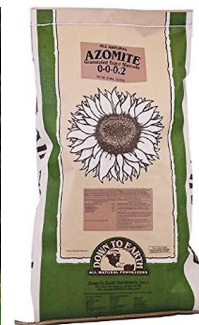
Azomite® Soil Re-mineralizer