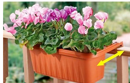
Adjustable Railing Planters

late night television and a commercial comes on for some random, yet brilliant product that you wished you had invented? Well, there was a vendor who had a booth full of stuff like this, and we went crazy placing orders. We couldn't pass up the adjustable railing planters that can rest on a balcony railing anywhere from 1" to 4" wide. In each planter, there is a nifty drainage system for urban gardeners who don't have easy access to places to plant or ways to let container plants drain. This is a solution that will bring out the green thumb in you. We also liked the Flower Tower , which is a 3' tall planter