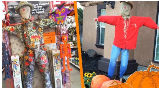
Build Your Own Scarecrow

At the height of the hot summer we endured in San Diego, I fled to Las Vegas, where it was even hotter. I wasn't there for pleasure, but to attend a lawn and garden trade show. Our team was essentially shopping for you; looking for new products we think you would like. Here's what we found: