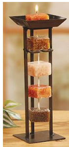
Candle On A Rope