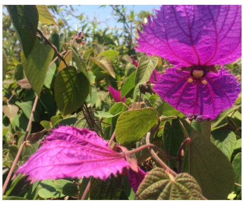
'Purple Butterfly Vine'