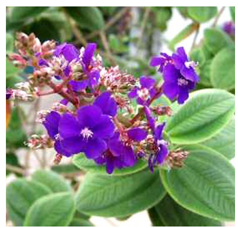
Tibouchina from San Marcos Growers

Tibouchina heteromalla is a very showy and kind of unusual plant. It grows in