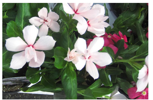
Vinca 'Soiree Double'