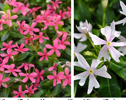
Vinca 'Soiree Ka-wa-a-ii