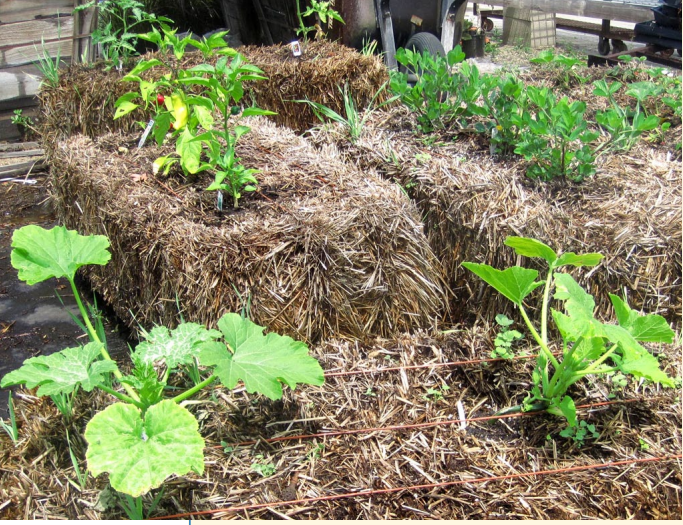
Straw Bale Gardening

Bear in mind, we planted these bales about two months ago. Interestingly, if you poke your finger into the bale, you see what looks like soil. The bales are composting and the plants are flourishing. It's early in our experiment so we'll update you on the results later. •