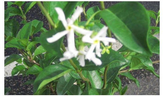
Star Jasmine 'Sassy Sasparilla'