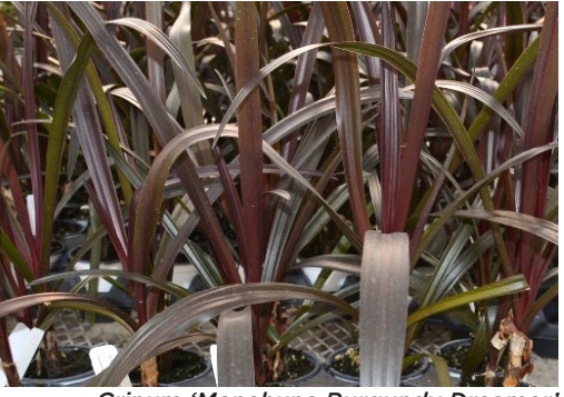
Crinum 'Menehune Burgundy Dreamer'

Very Limited!! We have special test samples of a tri-colored bougainvillea. Three bougainvilleas are grafted onto a single stem. These may or may not be available again.