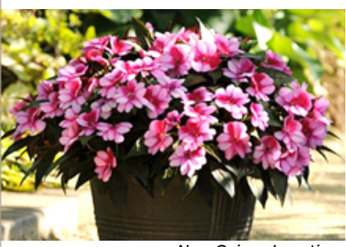
New Guinea Impatiens

Such a valuable little color wonder for areas that always seem to be on the damp but well draining side. Many colors and leaf shapes to ponder. Pinch often! Up to 18" tall and wide. Ideas: Lovely massed, but also use them to contrast taller, grassy foliage plants.