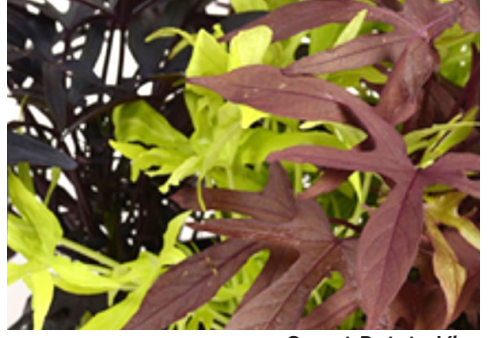
Sweet Potato Vine

A large family of flowering shrubs, several species are grown as frost tender container plants that are so ideal for hanging baskets. Seriously, look at those drooping, tubular flowers! Up to 1' tall and wide. Ideas: Add tiny white lights to a hanging basket of fuchsia for a lush living chandelier.