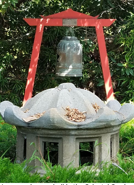
Japanese bronze bell in the Oriental Gardens

For more information about Quarters 1 and Butler Gardens, click on the link below.