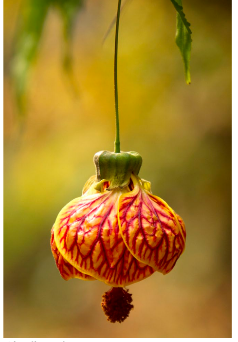
Abutilon 'Tiger Eye'

The common name is Flowering Maple or Chinese Lantern and they are upright, branching plants and some varieties have a structure reminiscent of a Japanese maple. They are low growing woody subshrubs that perform best in partial shade with well-