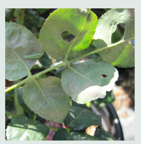
Tell tale holes in leaves are a clue that you should turn over a few leaves and try to spot these green, caterpillar-like larvae.

However, some take longer to work which gives more time for damage to occur. Once Rose Slug is detected on the plant, a quick acting spray should be used to knock them down. Bonide Eight and Bio Advanced 3-in-1 Insect Disease and Mite Con trol will work very effectively and quickly. They are best applied with a hose end sprayer to insure that the underside of the foliage, where the Rose Slugs are hiding, is treated. For a more organic approach, consider using Captain Jacks Dead Bug Brew with spinosad as the active ingredient, again making sure the underside of the foliage is treated. Usually two to three applications seven days apart are enough to break the life cycle of the saw fly and get the Rose Slugs under control. No matter what you spray, make sure that you do it at a time when bees are not active. Spraying in the evenings is a good plan as the bees are not as active and the plants have a chance to dry overnight.