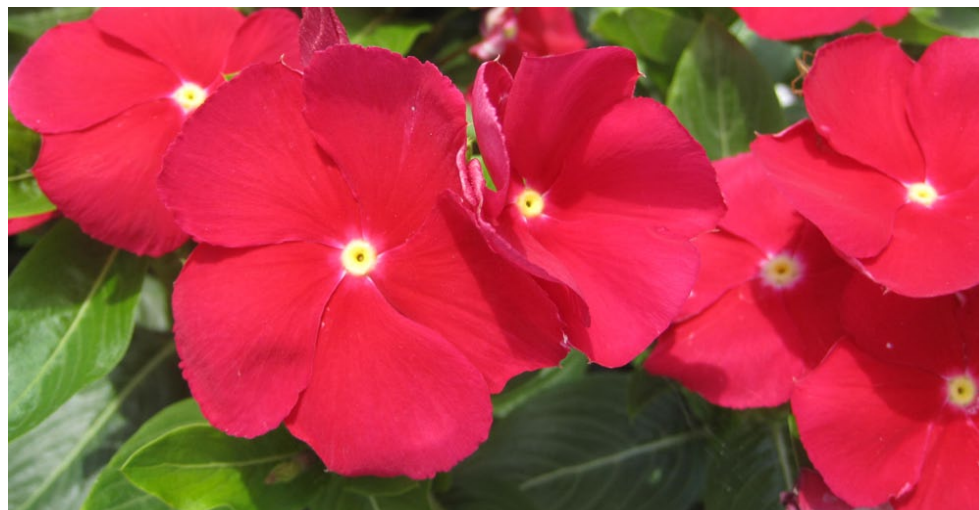
'Cora Red' Vinca

Here are some great color ideas for containers. We think Vinca is looking a lot better than it used to. Vinca loves the heat and look at just a couple of the new vivid colors we carry. ' Cora Red ' is a brilliant, clear red color and for something really unusual, check out ' Jams 'N Jellies Blackberry '. This Vinca is such a deep