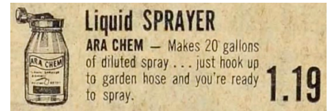
AraChem in 1950s newspaper ad

AraChem was a company in El Cajon located at 808 Gable Way, in the industrial part of the city. It was started