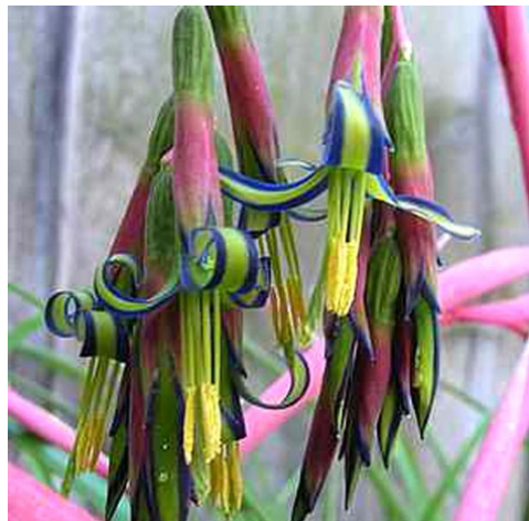
'Queen's Tears' or 'Friendship Plant'

The photo of this bromeliad really does it justice because it captures the unusual color combination realistically. The photo was taken by Santa Barbara landscape architect Billy Goodnick and showcases why the plant received its common names, Queen's Tears or 'Friendship Plant'. Billbergia nutans is commonly called 'Queen's Tears' for the ornate hanging flowers with royal blue highlighting that often exude tear-like droplets of nectar, while the name 'Friendship Plant' is attributed to this plant multiplying readily and propagating so easily that it is often passed between friends.